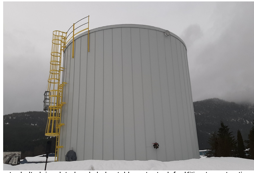
Fig. 4 - 400 cubic meter bolted, insulated and clad potable water tank for Kitimat construction camp.