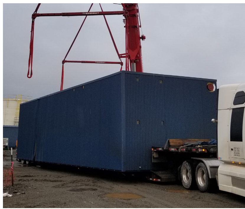
Fig. 7 – 200 cubic meter insulated and clad coated carbon steel EQ tank loaded for transport.