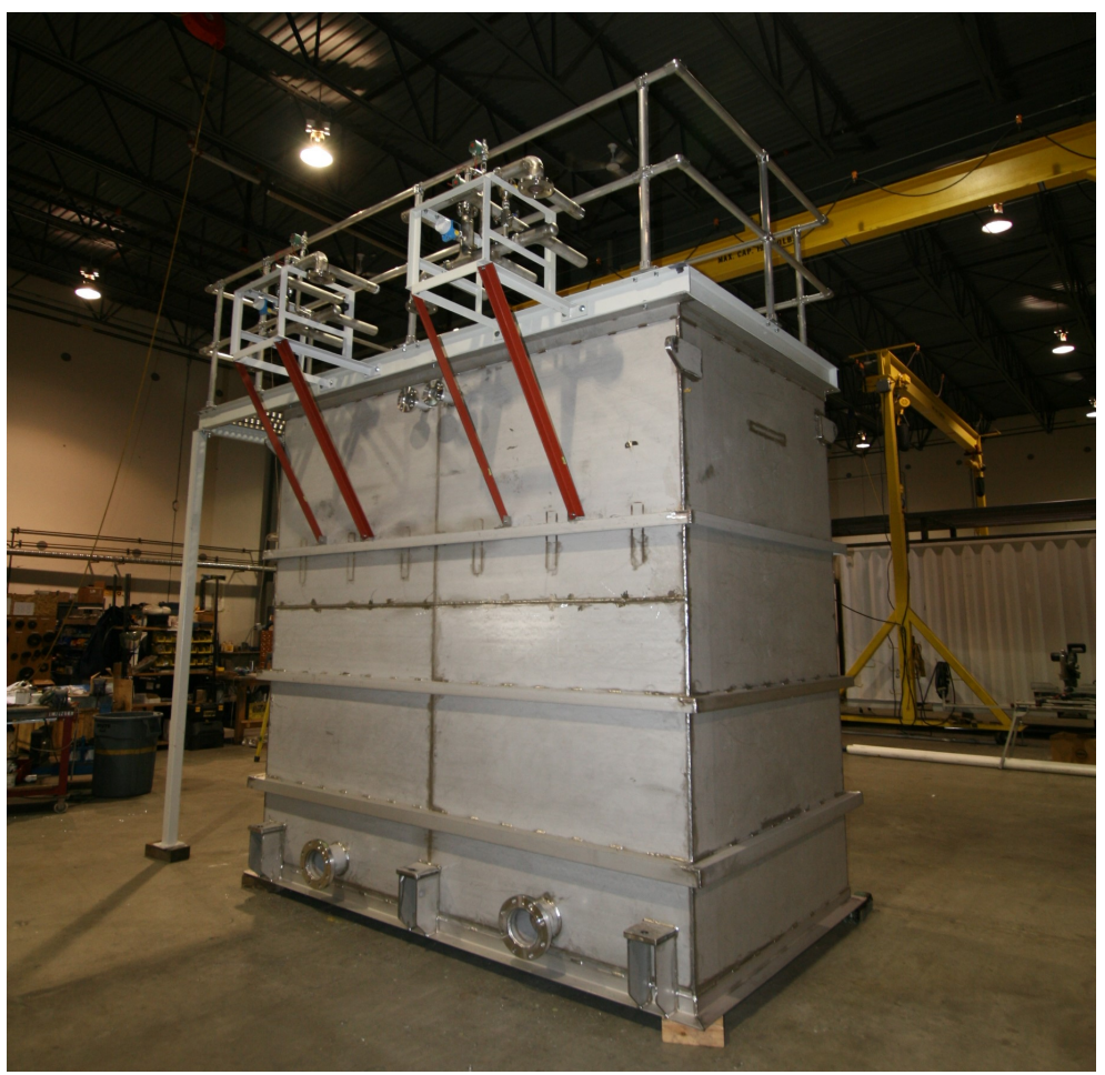
Fig. 1 - Stainless steel tank fabricated for Bend, Oregon MBR system.

Examples of tanks produced by BI Pure Water: