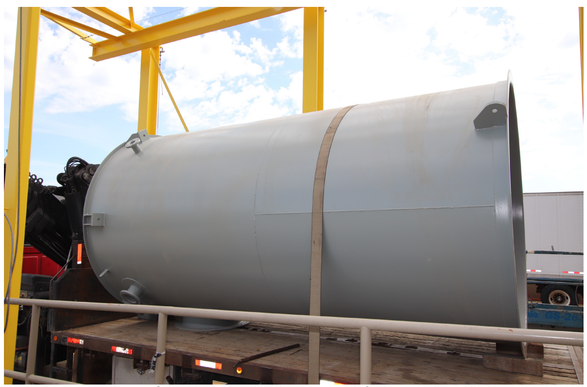
Fig.6 – Cylindrical coated carbon steel tank for Interpipeline, Alberta.