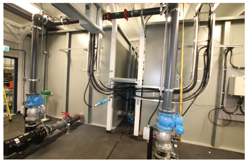
Fig. 8 - Dual 60 cubic meter MBBR tanks housed within modular buildings

BI Pure Water has over 25 years of experience designing, fabricating, installing, commissioning and servicing custom water treatment systems. Our clients include municipalities, utilities, mining and industrial firms who have the highest standards of quality and reliability. Our systems are designed with safety, durability and ease of operation and maintenance in mind.