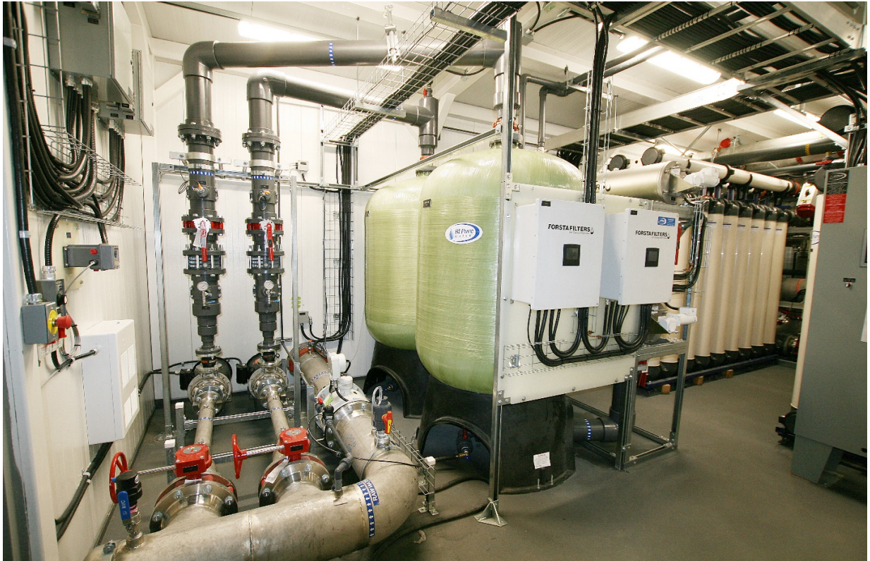
Figure 2 - Plant inlet with chemical contact time tanks and UF membranes (right)

Automatic self-cleaning filters (200 micron) are the first stage of filtration. An optional coagulation chemical injection system is provided which is controlled by the HMI and which allows maximization of the filter performance through the UF unit.