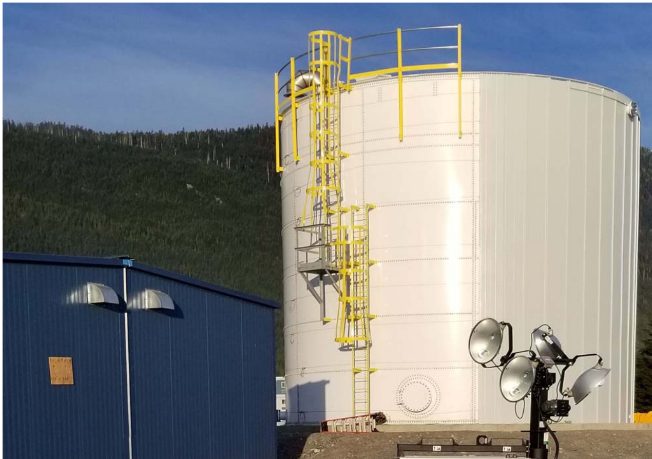
Figure 5 – Water treatment plant (left) and site built raw water storage tank (right)

The Grundfos distribution pump system, consisting of 5 vertical pumps, with a 6th on standby, delivers 1283 litres/min (339 US gpm) and are powered with a Grundfos VFD speed control system for each pump. An Amtrol 500L bladder tank provides the required volume during low demand periods to reduce pump short-cycling. A BI Pure Water subcontractor, Aurora Tanks BC, provided the raw and treated water tanks.