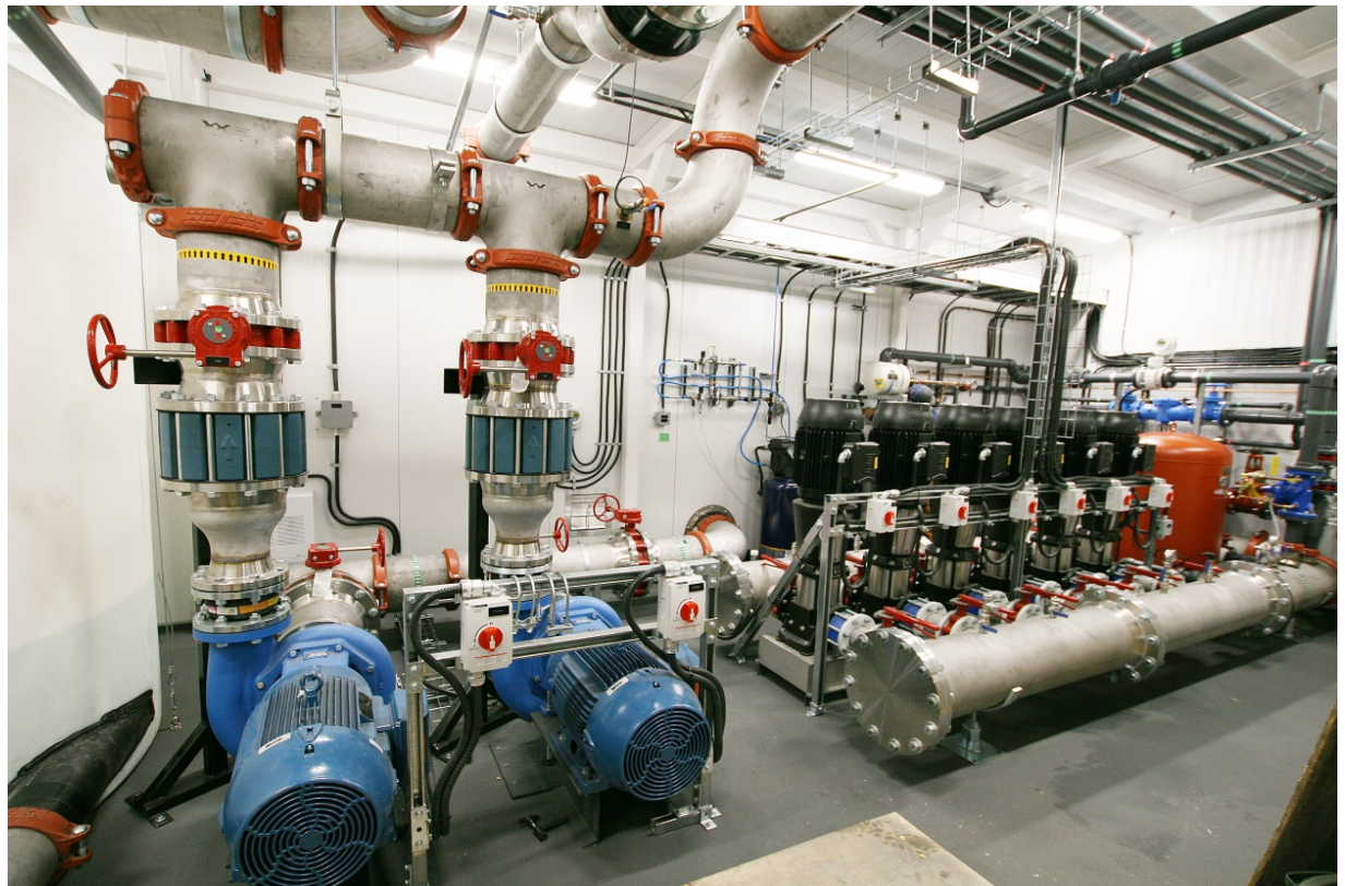
Figure 3 - UF backwash pumps (left), distribution pumps (right)

Automatic self-cleaning filters (200 micron) are the first stage of filtration. An optional coagulation chemical injection system is provided which is controlled by the HMI and which allows maximization of the filter performance through the UF unit.