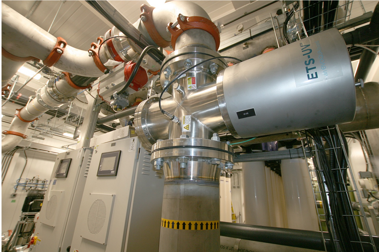
Figure 4 - UV units with a control panel for each UV reactor

While the UF process can effectively remove bacteria including Giardia and Cryptosporidium, regular air integrity testing, which is a regulation for UF to produce potable water, would increase complexity and operating costs. However, since this UF system offers turbidity reduction only, it can be operated without air integrity testing. The UV and Chlorination process following the UF treatment guarantees the required 3 log reduction of Giardia & Cryptosporidium and 4 log reduction of virus concentration.