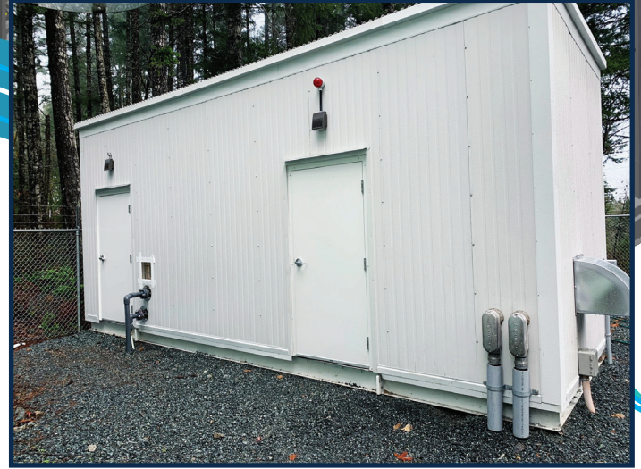
Figure 1: Exterior after installation

Bi Pure Water completed a package water treatment system for the Hupacasath First Nation located near Port Alberni on Vancouver Island. This system uses a state of the art gravity-fed ultrafiltration system developed by UBC/RES'EAU.