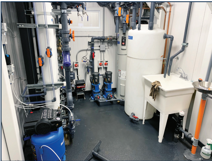
Figure 2: Interior of completed system