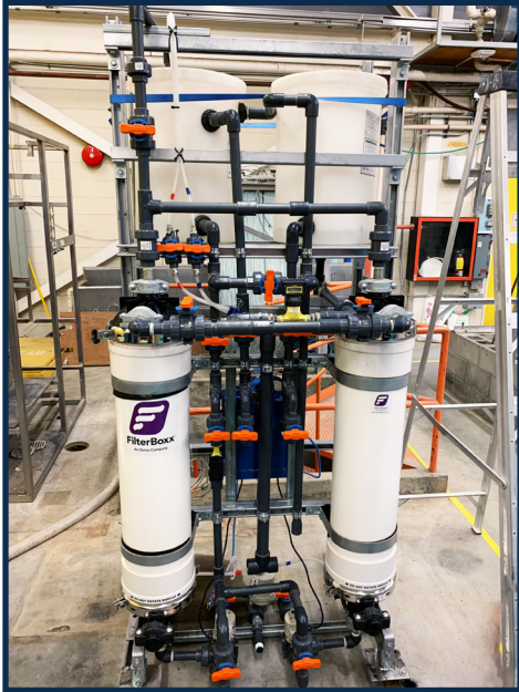
Figure 3: Ultrafiltration skid at UBC

This means that no pump is used to produce the pressure required to filter raw water through the Membrane Modules. The difference between the elevation of the water level in TK-110 and the elevation of the open valve on the Permeate Header generates the pressure required for filtration.