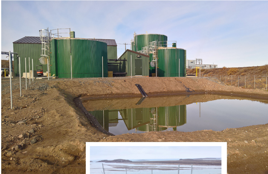
The new water treatment plant and the sump with turbid raw water intake

The hamlet of Kugluktuk, Nunavut, known as Coppermine until 1996, has a population of 1500 and growing. Its location at the mouth of the Coppermine River, and on the shore of the Arctic Ocean on the Canadian Shield creates a challenging water source. The drinking water